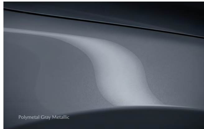
Polymetal Gray Metallic