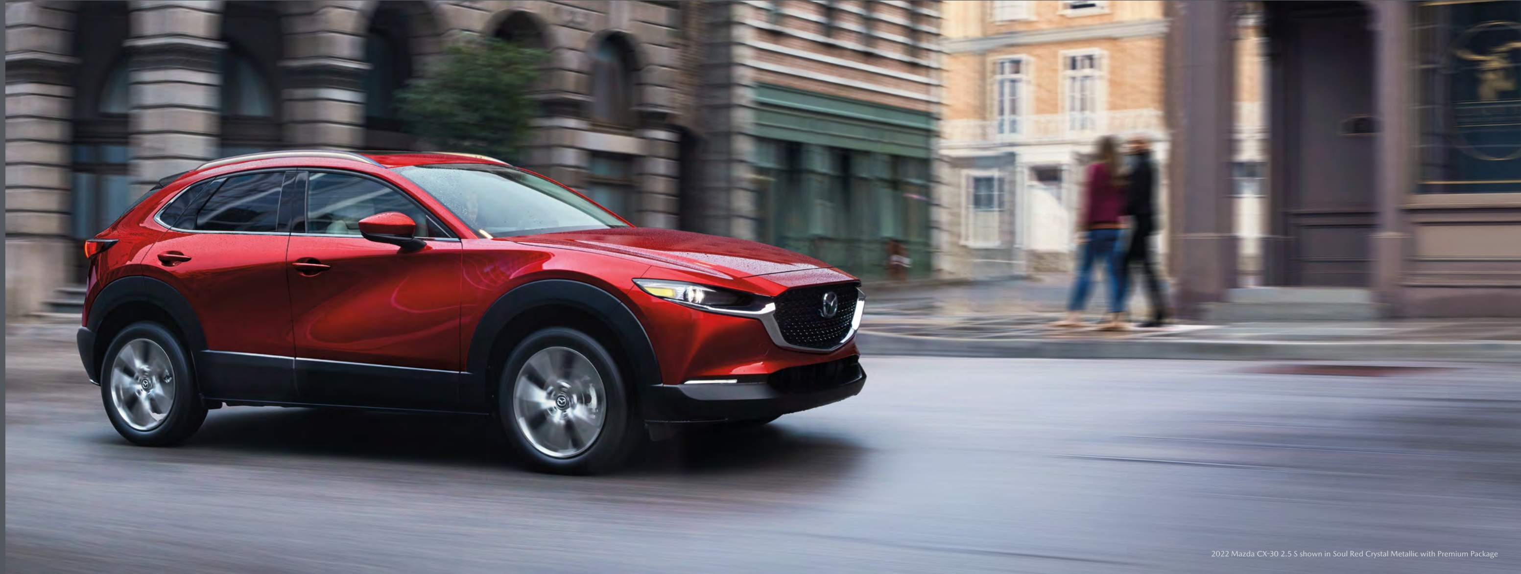
2022 Mazda CX-30 2.5 S shown in Soul Red Crystal Metallic with Premium Package