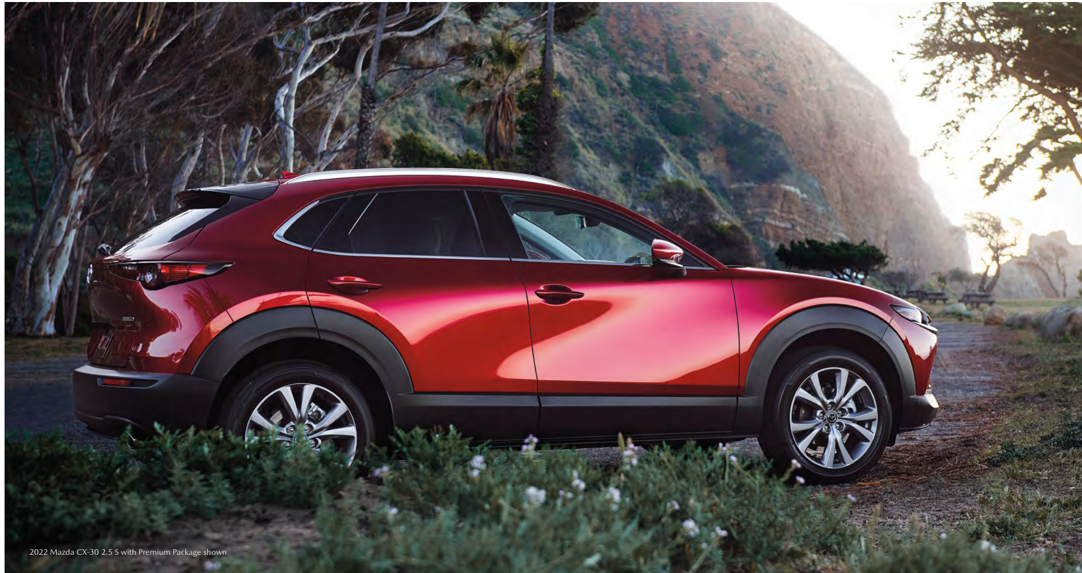
2022 Mazda CX-30 2.5 S with Premium Package shown